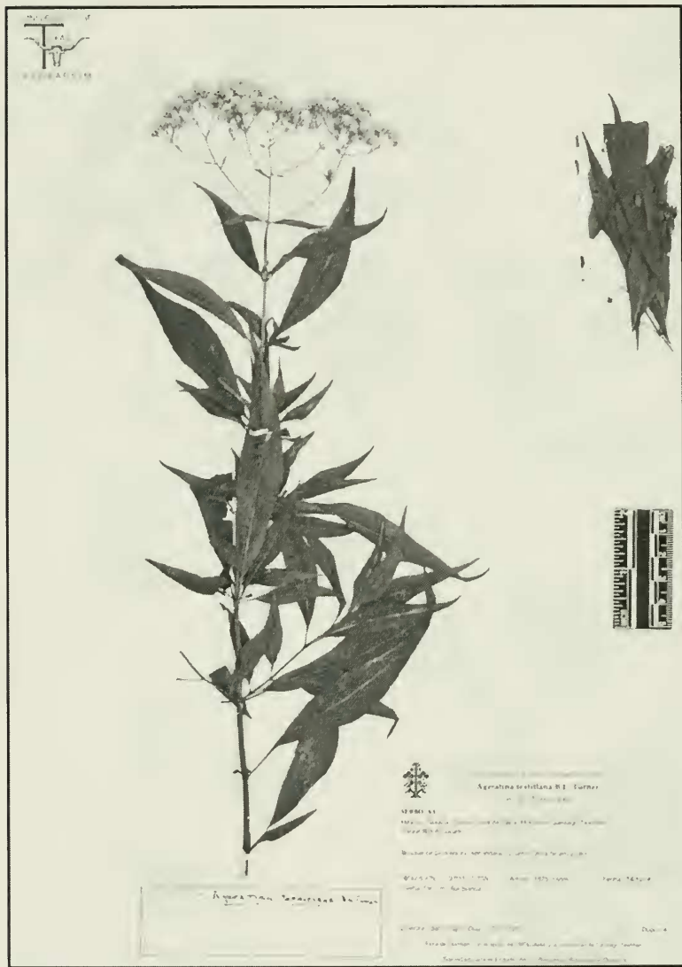
Fig. 6. Holotype of Ageratina textilana .